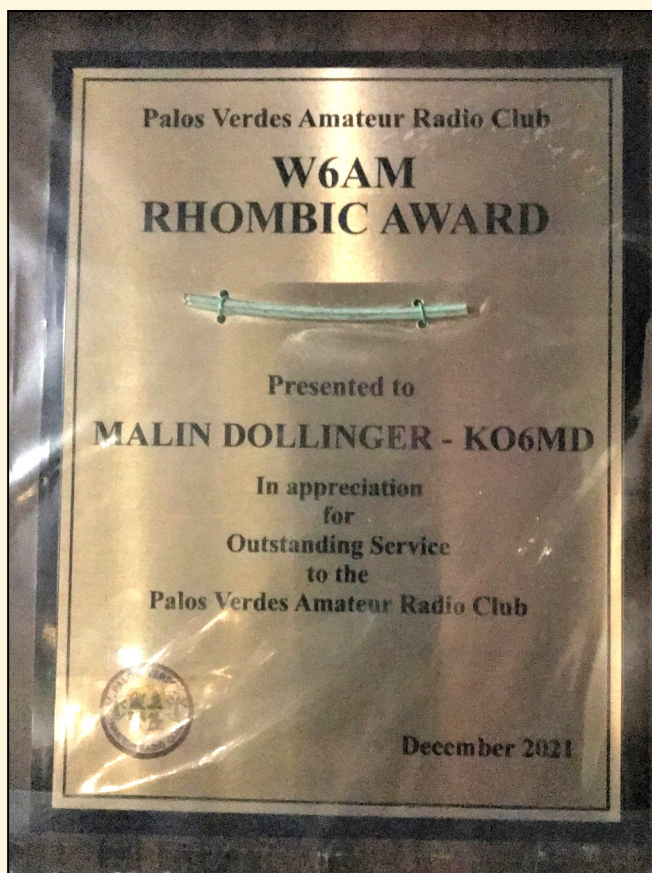
Left: The PVARC’s Rhombic Award for outstanding club service features a snippet of copper wire from the massive rhombic antenna formerly at the Rancho Palos Verdes station of legendary DXer Don Wallace, W6AM (SK). Until his death in 1985 Don’s rhombic antenna reached all corners of the globe from what is now the Wallace Ranch group of luxury homes at Highridge Road and Crestridge Drive.

(Note: This photo shows the 2021 Rhombic Award inside protective plastic wrapping.)